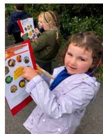
We loved exploring in the community on our autumn scavenger hunt! We made woodland animals from the things we collected.