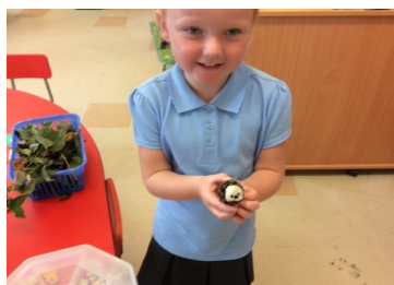
We made hedgehogs using pine cones and playdough.