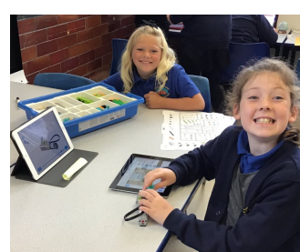
We enjoyed learning coding skills with a LEGO WeDo.