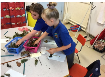
Making autumn pictures with leaves.